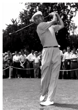
- Ben Hogan

"Reverse every natural instinct and do the opposite of what you are inclined to do, and you will probably come very close to having the perfect golf swing."