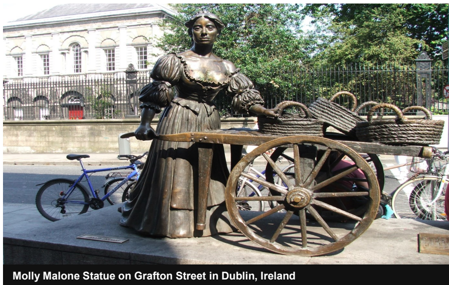
Molly Malone Statue on Grafton Street in Dublin, Ireland