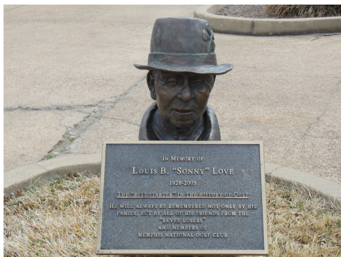
Sonny Love bust in front of the Clubhouse